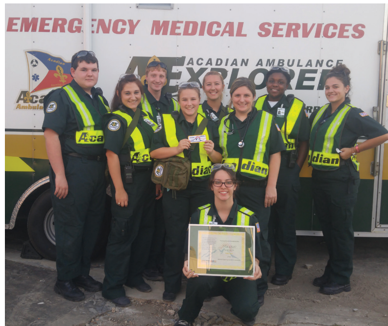
The Vermilion Explorer post was recently awarded for achieving Gold Level of the National Exploring Journey to Excellence.